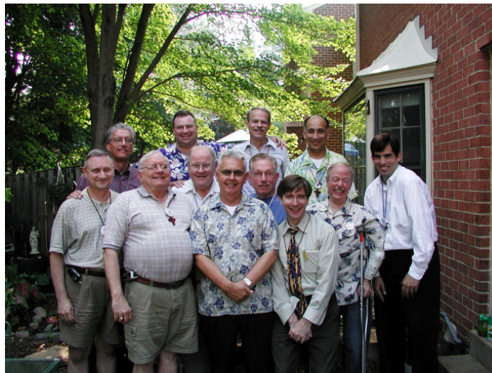
Cursillo Team in formation for the weekend.

Second, every week, as a small group of friends, we hold ourselves accountable in the areas of piety, study, and action. The idea is to compare what we said we were going to do in each area with what we actually did , and note what is, and what isn't, working for us. Then we share what we plan as our next step in each area. We call this process of taking steps and sharing the results Group Reunion . By doing this in