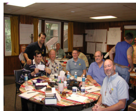
A group on the weekend

In addition to the profound issues we’ve mentioned, the weekend is also a time of great joy and fun! And there’s a lot of music and singing – if you play an instrument, bring it!